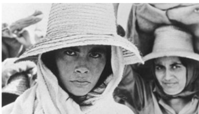
Still from Lucía , directed by Humberto Solas (Cuba), 1968.